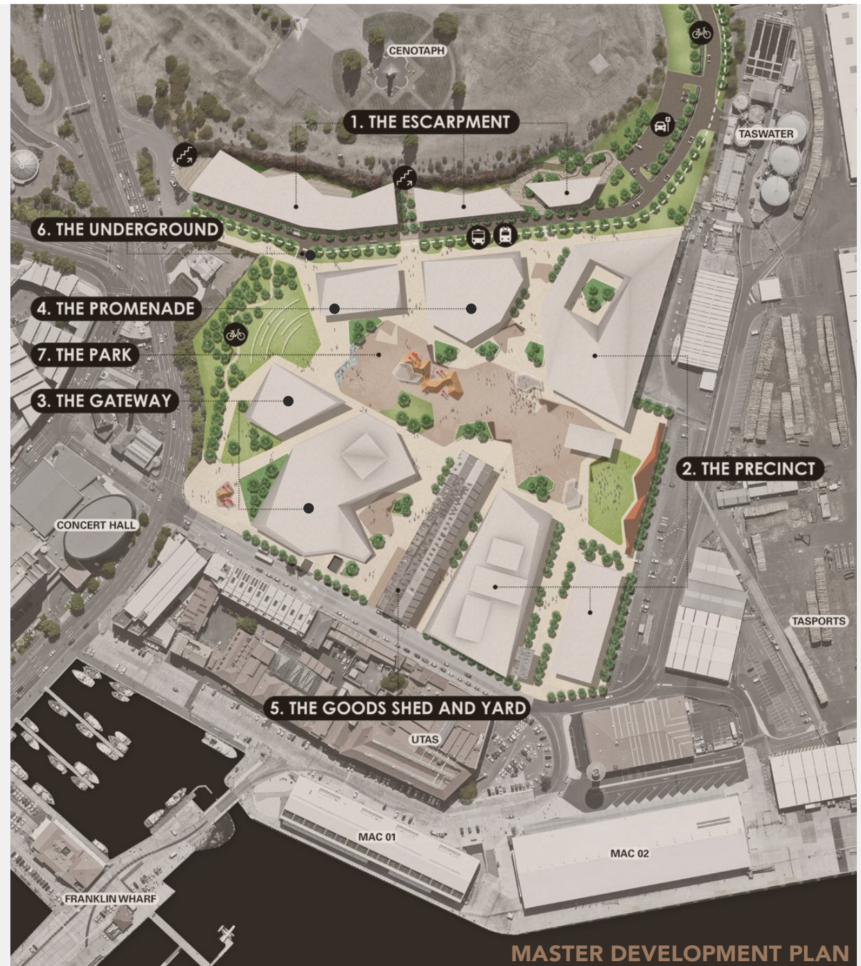
MASTER DEVELOPMENT PLAN

Stage one of the Northern Vehicular Access project has been completed, which has opened up the site for further development to occur.